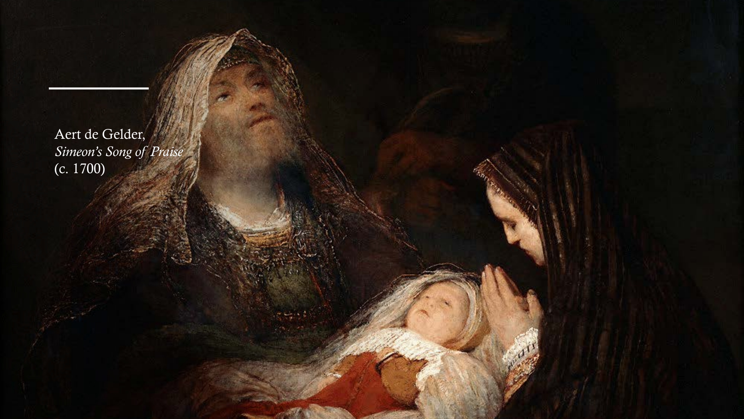
Aert de Gelder, Simeon's Song of Praise (c. 1700)