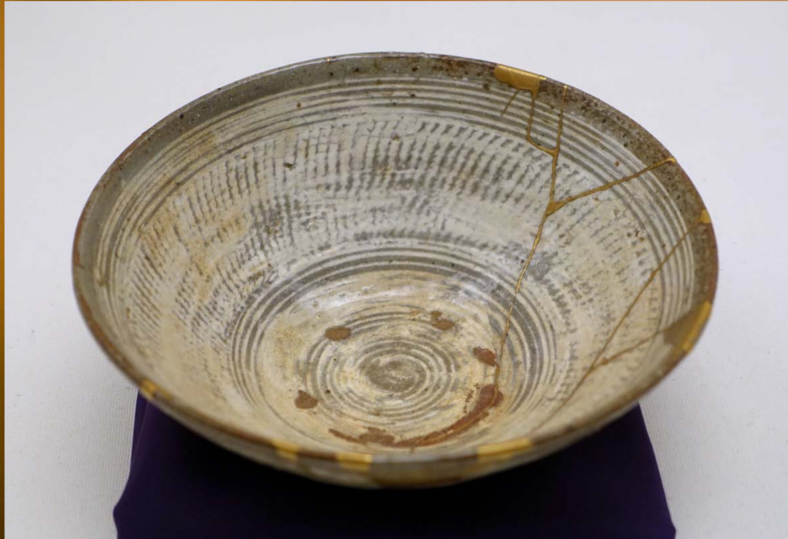
Tea Bowl, Korea Joseon Dynasty (16 th Century)